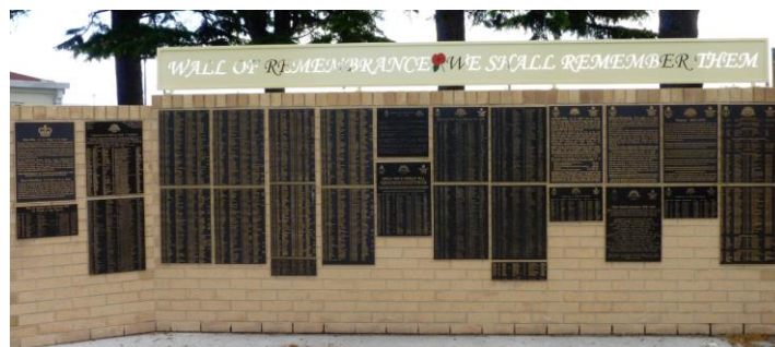
Wall of Remembrance, St. Helens, Tasmania

"What these men did nothing can alter now. The good and the bad, the greatness and the smallness of their story will stand. Whatever of glory it contains nothing now can lessen. It rises, as it will always rise, above the mists of ages, a monument to great hearted men; and for their nation, a possession forever. "